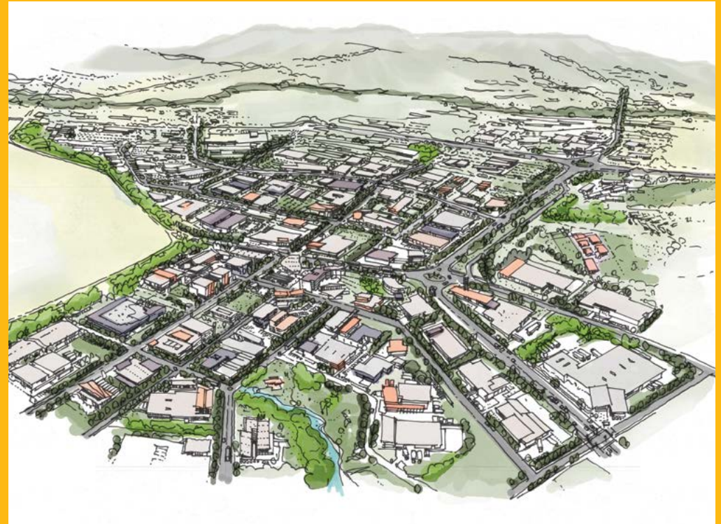
Artist's impression of a proposed specialised centre in the Western Sydney Employment Area

Western Sydney's population is growing rapidly. The number of people living in Western Sydney is expected to rise from 2 million in 2011 to 2.9 million in 2031. The New South Wales (NSW) Government expects this population surge to fuel demand for over 300,000 new jobs across the whole of Greater Western Sydney.