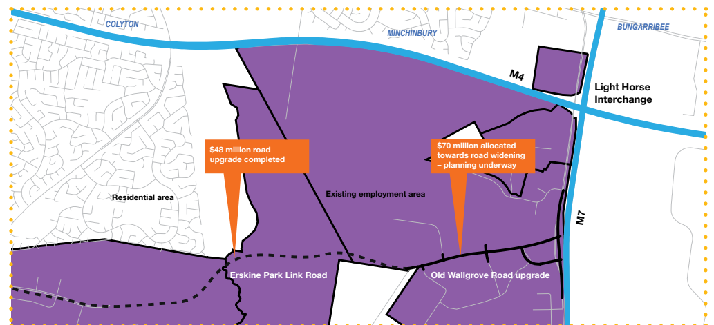
Map showing Old Wallgrove Road upgrade